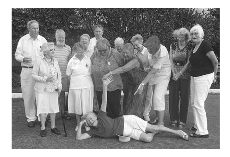
L'atmosphère de l'amitié